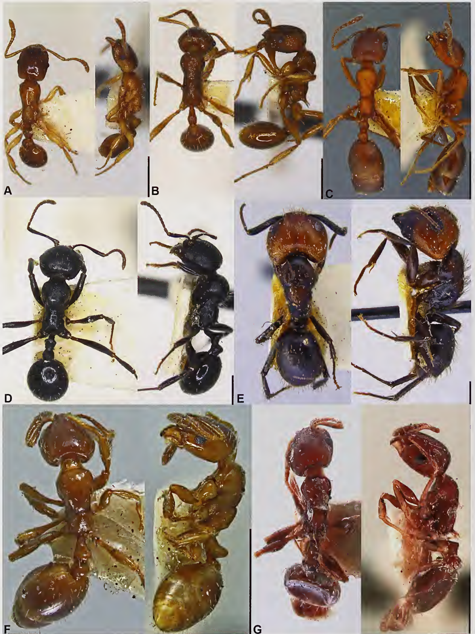
Fig. 1. Syntypes ♀ dorsal/lateral views. (A) Strongylognathus huberi Forel, 1874. (B) Myrmica smythiesii Forel, 1902. (C) Monomorium indicum Forel, 1902. (D) Messor lobicornis Forel, 1894. (E) Camponotus bugnioni Forel, 1899. (F) Monomorium smithii Forel, 1892. (G) Temnothorax algiricus trabutii (Forel, 1894). Scale bars 1 mm.